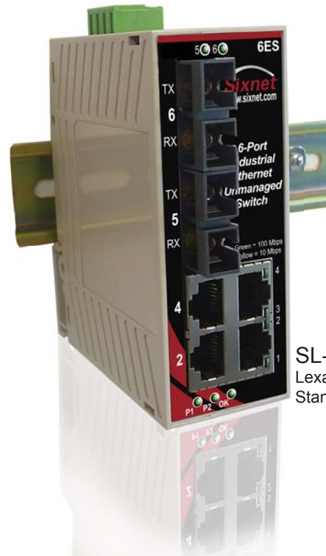
SL-6ES-4/5 Lexan Case Standard Temperature