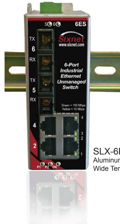
SLX-6ES-4/5 Aluminum Case Wide Temperature

We have been designing industrial hardware such as Remote Terminal Units for over 30+ years and have used this expertise to design the toughest Ethernet switches on the market. Don't trust your critical communications to so-called industrial hardware from commercial switch manufacturers. Sixnet switches give you proven assurance that your system will keep running for years to come.